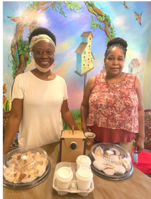
Thank you to Something Natural in Greenwich for providing the staff with delicious baked goods for National Assisted Living Week!