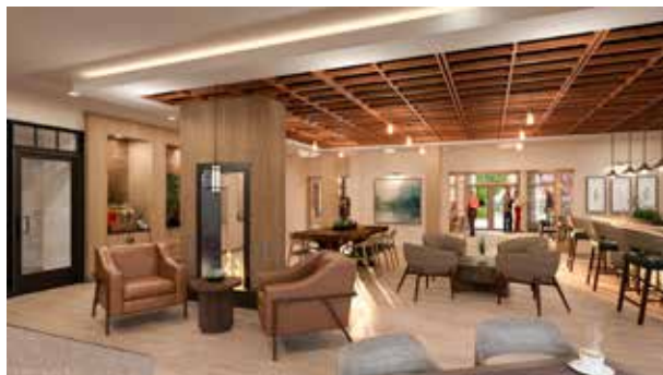
Monarch Cooper's Corner lobby and wine bar.

Please inquire about our Founder's Circle for early depositors.